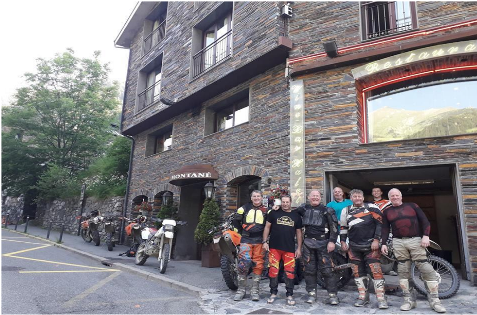
SOME REGULARS ENJOYING THE MOTORBIKE ROUTES AROUND ANDORRA